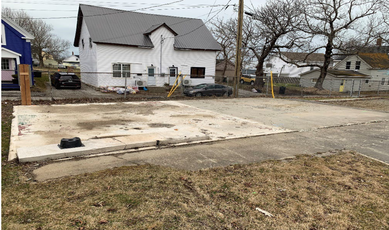
Existing concrete pad where pavilion is to be constructed