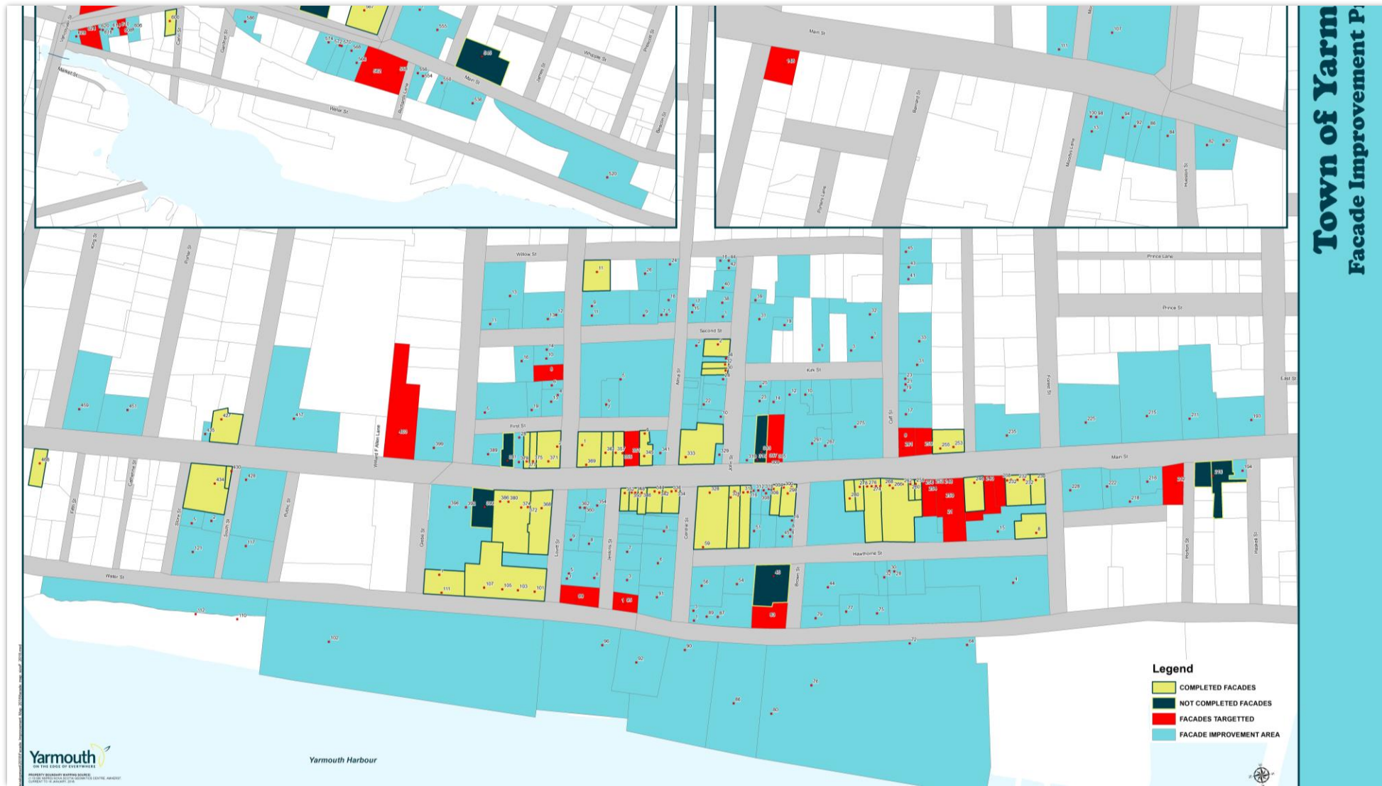
Phase 2 Façade Program Map